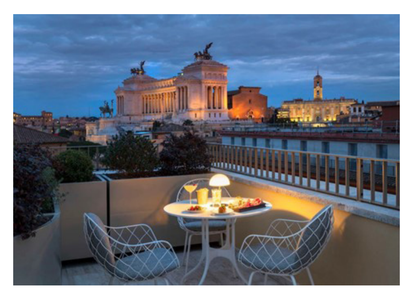
View from your hotel rooftop