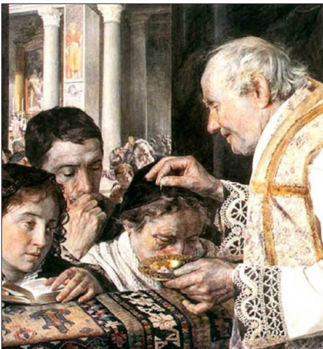
Ash Wednesday. Julian Fałat. 1881.

We might say that Lent is turning time. A more theological word for that is conversion time. That word “conversion” means literally “to turn around,” to change direction. For Christians, conversion really means to change the direction my life is taking. Am I heading toward God, or away from God toward false gods? Day after day, our secular culture assails us with lies about its false gods. We are asked to believe that what makes for happiness is the pursuit of wealth, power, status, and pleasure. Christians can naively absorb some of that mentality and think they can have it both ways. They think they can give God some attention while pursuing a false god at the same time. I am reminded of the ancient saying: “Pity the person who walks the earth on two paths.” Imagine trying to get to your destination by traveling in two different directions. How torn and divided you would feel!