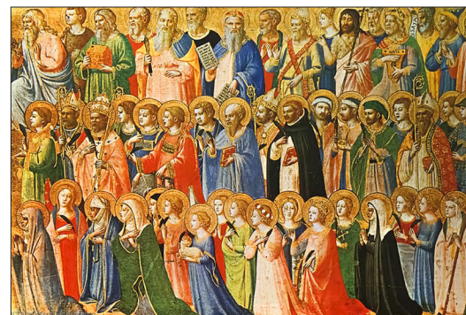
The Forerunners of Christ with Saints and Martyrs. Fra Angelico. 1420s.

This one body is the Church. This was St. Paul’s great insight. His concept of the Church as the Body of Christ goes back to the memory of his own conversion to faith in Jesus and to the words spoken to him at his conversion: “ I am Jesus who you are persecuting. ” This implies that Christians are identified with the risen Christ. In Paul’s writings, Christians are united with the risen Christ by baptism and the Eucharist which make them parts of Christ’s body united in such a way that He and they form together the Body of Christ, the Church.