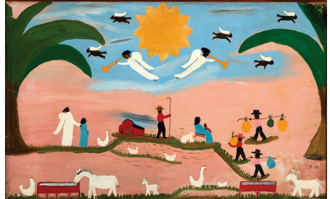
The Annunciation and the Adoration of the Wise Men. Clementine Hunter. 1957.

Epiphany! The word means “appearance” or “manifestation” in Greek, the language spoken for the first two centuries after the time of Jesus. Epiphanies are manifestations of God. They lure us into new ways of seeing God, encountering God, engaging God, celebrating God. The Magi followed the Star looking for a King. Apparently, they were familiar with the Jewish prophecies that had foretold an expected savior-King. “Where is the newborn king of the Jews? We saw his star at its rising and have come to do him homage,” they questioned King Herod.