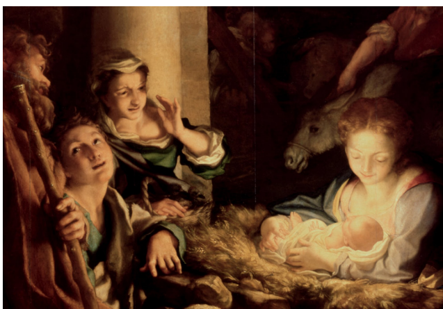
The Holy Night. Antonio da Correggio. 1522-1530.

Somber clouds are gathering in a whirlwind of uncertainty. The world's superpowers are once again involved in a game of one-upmanship. A cycle of violence is erupting on our city streets. Civil discourse and common courtesies have been replaced by tirades of partisanship. Discrimination and injustices are being legitimized. Climate change is playing havoc in once serene places. Misery has become a way of life for many. Bread lines are longer, and those who are homeless are far too great in number for a world awash in resources enjoyed by far too few. Drumbeats can be heard in the distance in a tempo of frenzy that has been unprecedented in our time. The world is weary and losing patience waiting for a way out from the entanglement of today's baffling realities.