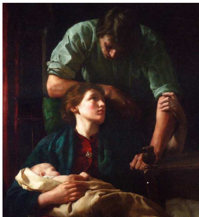
The Family. John Dickson Batten. 1886.

As I contemplate the Holy Family, my thoughts turn to Joseph and his role in the Holy Family. We know Mary said yes. We are often reminded of her blessed willingness in our faith tradition. Joseph's yes has a more subtle quality than Mary's yes. He is a man who remains dedicated to his commitment even with its challenges. I imagine being the father in the Holy Family household may have been fraught with personal, emotional, and spiritual challenges.