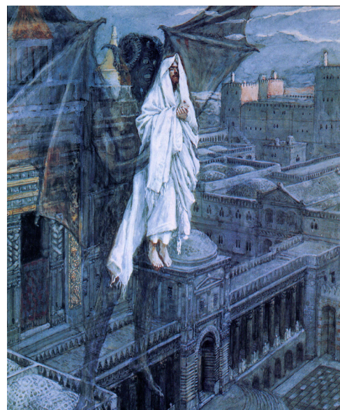
Jesus Carried up to a Pinnacle of the Temple. James Tissot. 1886-1894.

In Jesus' earthly life, God's love had a face. Jesus was totally charismatic and drew large crowds to himself. Now he is invisible to us. But he becomes visible through people. It happens through their selflessness and compassion, through the witness of their lives.