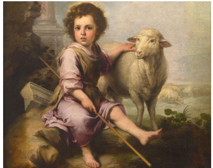
The Good Shepherd. Bartolomé Esteban Murillo. c. 1660.

Jesus taught us to go out in Love and to serve humankind as he showed us. He is our teacher, just as a mother is the first teacher to her child. Jesus beckons us to follow him, and he will not allow anyone to be snatched from his or God’s hand. The Shepherd cares for us, is protective of us, guides us, and leads the way. These characteristics are closely aligned with how a mother cares for her children. Jesus is the Shepherd who knows us intimately and calls each one of us by name and is concerned with our safety. Jesus doesn’t have to push or prod us to follow him, rather, he leads by example. He guides us gently on the path to everlasting life. We are with him and God for eternity. Although the bonds may twist and fray, Jesus tells us we are never severed from him. And, even if the bond between mother and child frays, the spiritual bond will remain through the love of Jesus.