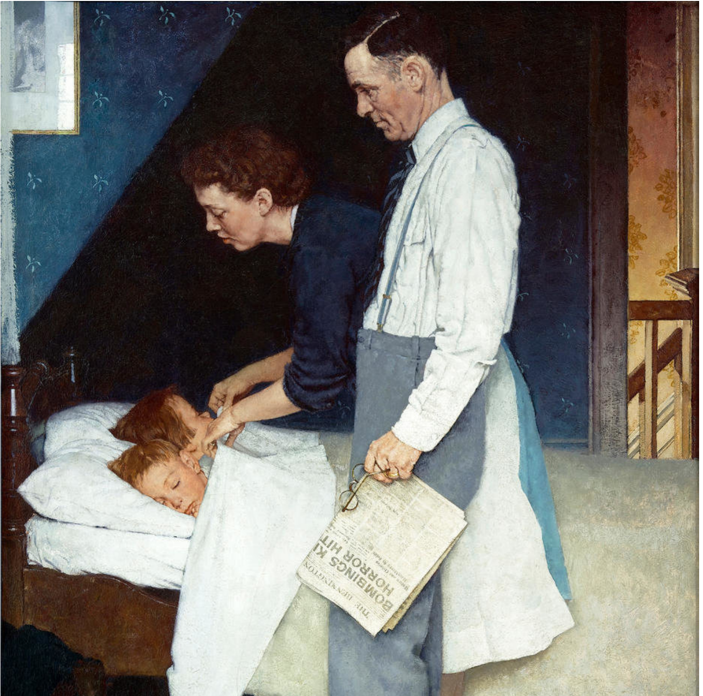
Freedom From Fear. Norman Rockwell. 1943.

Join us on Monday, May 6th at 7 PM in Wallace Hall for our lecture "Freedom From Fear—Then and Now," presented by United States Senator Angus King of Maine: Freedom from fear was Roosevelt's fourth Freedom.