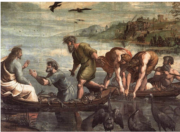
Raphael. "The Miraculous Draught of Fishes". 1515.

"A disciple is not above the teacher, but every disciple who is fully qualified will be like the teacher." Jesus clearly taught his disciples, that they can become qualified to teach like him, yet they will not be above him. The disciples had their place and their purpose as they were called to carry on Jesus' teachings. As Catholics, today, we are called to be faith-filled envoys of the same teachings of Jesus.